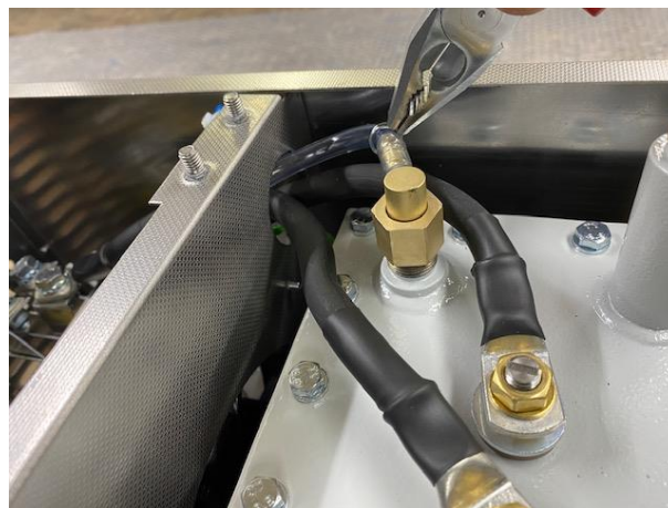
Remove any existing hose clamp