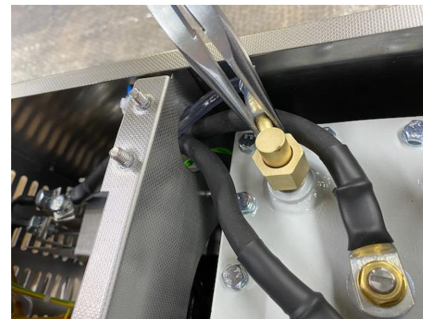
Strip off the hose using flat-nosed pliers