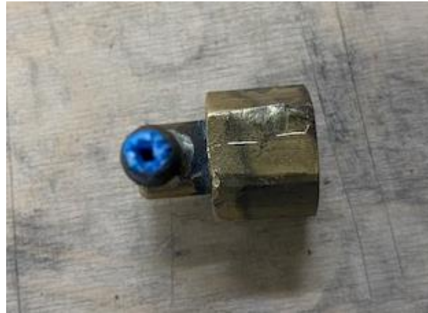
Check elbow fitting for blockage (here: blockage with blue deposit)