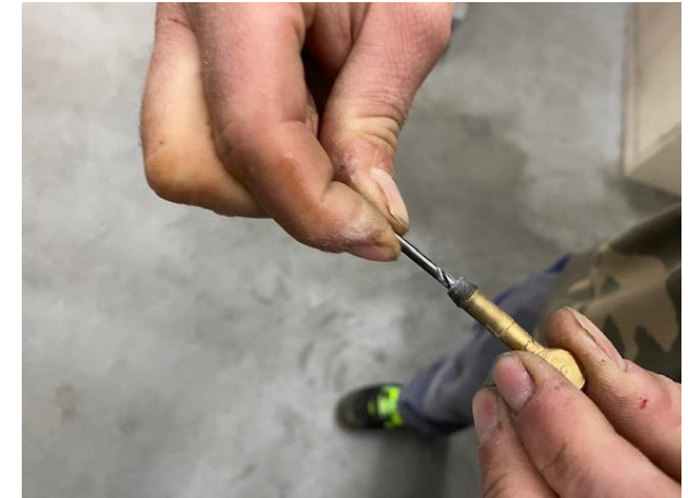
Clean the elbow fitting, e.g. with a drill or a small round file.