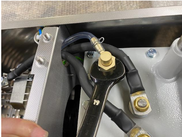
Unscrew the elbow connection with a 19mm wrench. To loosen, tap lightly against the elbow fitting.